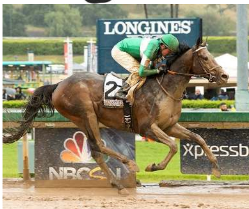
Exaggerator took sloppy Santa Anita Derby