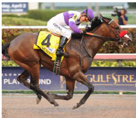
Nyquist winning Florida Derby