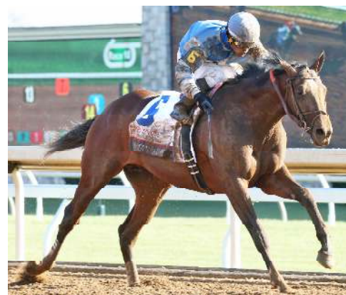
Brody's Cause grinded Bluegrass Stakes win